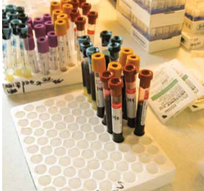
Participants gave ten vials of blood for research assessments at the start, middle, and end of their three-month retreat.

Most of us meditated in our rooms, though some shared a few sessions a day in the meditation hall. We took care of all the washing up and cleaning of the building in rotating