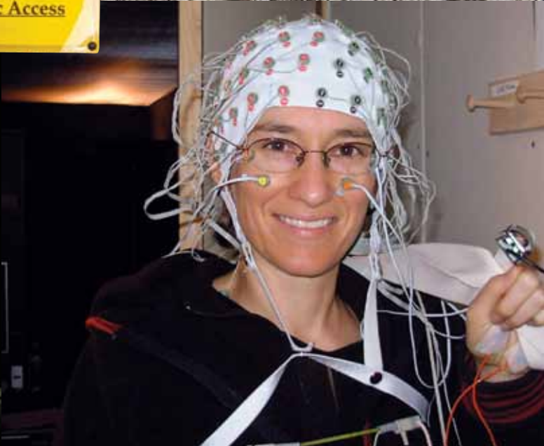
Project participants wear soft skullcaps with electrodes wired to an EEG machine to measure changes in their brain waves. The author is at the far right.