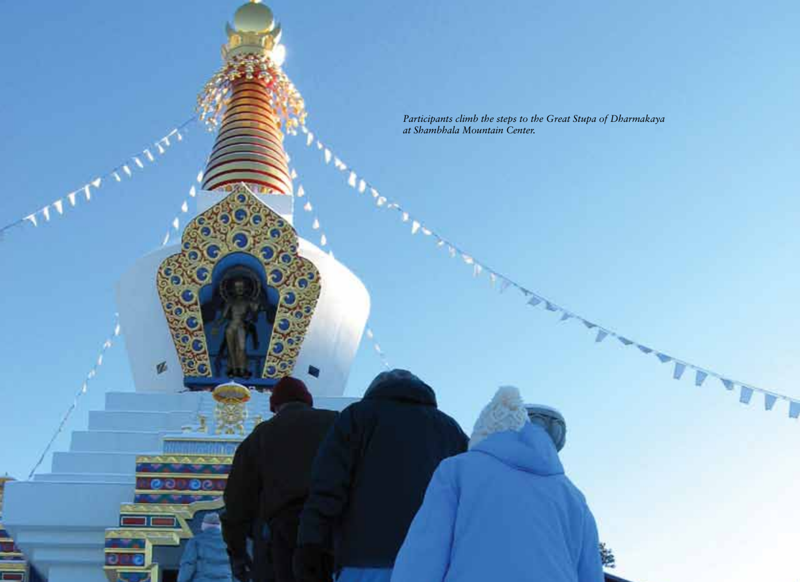
Participants climb the steps to the Great Stupa of Dharmakaya at Shambhala Mountain Center.

particularly for Westerners who are conditioned to think of themselves as separate individuals.