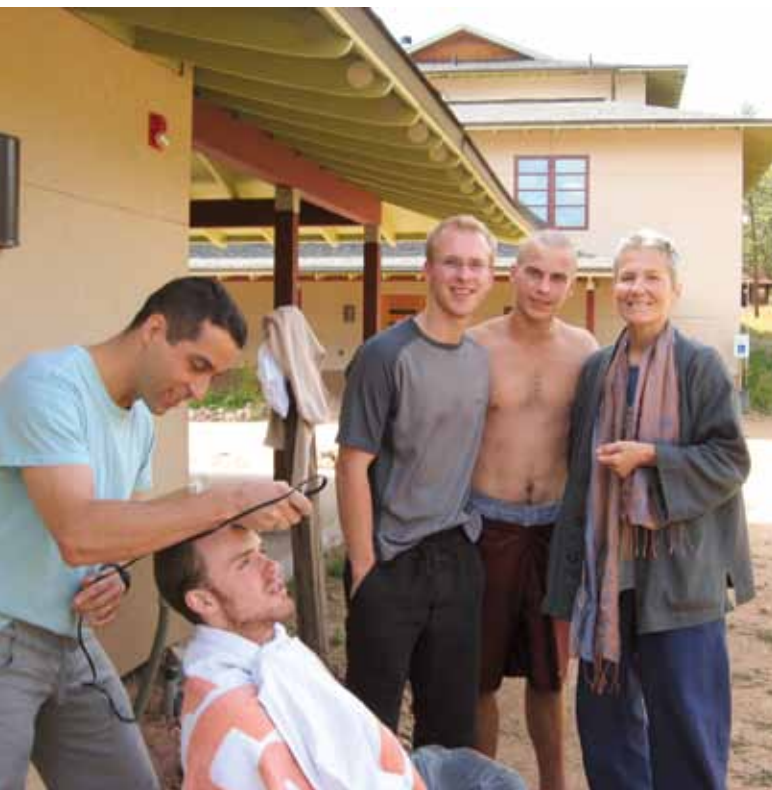
Several of the participants shaving their heads at the beginning of their retreat.

Attaining shamatha is the most natural or settled that the human mind can become. It is said to lead to an experiential realization of the ground state of the psyche, referred to as the substrate, or storehouse consciousness.